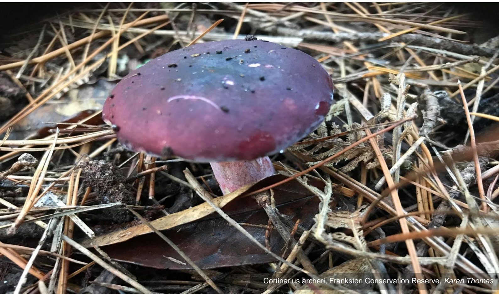
Cortinarius archeri, Frankston Conservation Reserve

How to set up an account and submit field observations